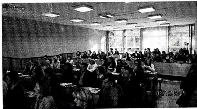
Photo 2. Training participants