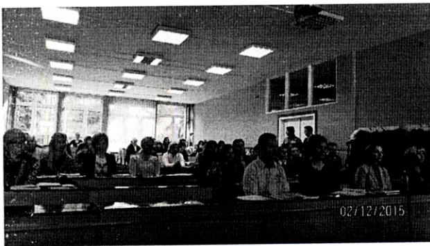
Photo 3. Training participants