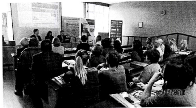
Photo 4. Training participant