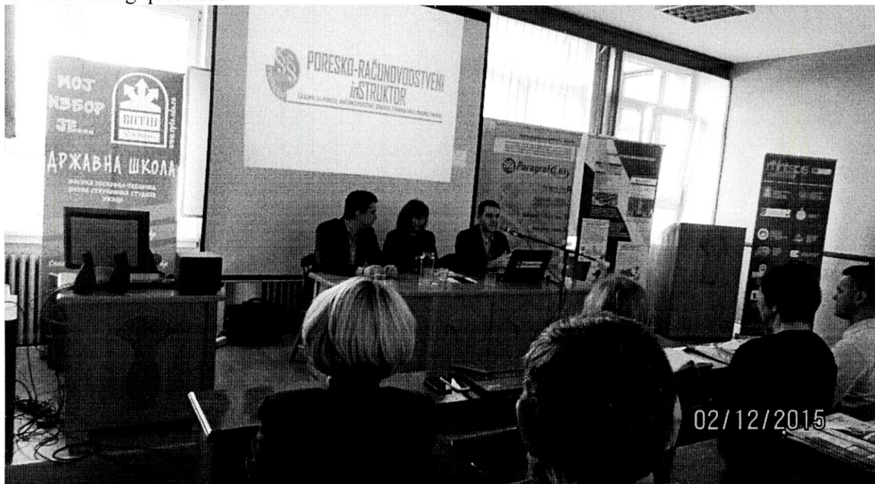
Photo 6. The experts from Paragraflex presenting the training material for the preparation of financial statements for 2015

The workshop devoted to solving specific problems, i.e. trying to find the solutions to specific issues in the field of business, was of special importance.